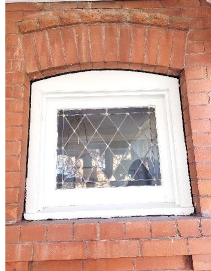
(Image 2.7: example of single sash window with decorative diamond patterned)