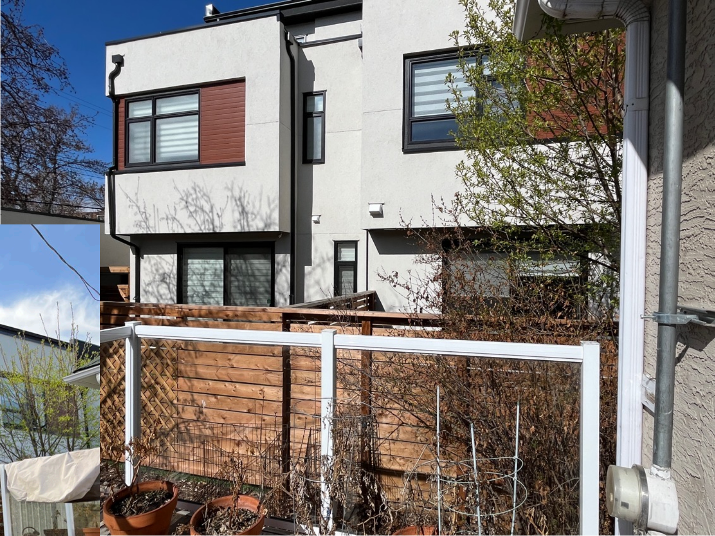
View from my back deck