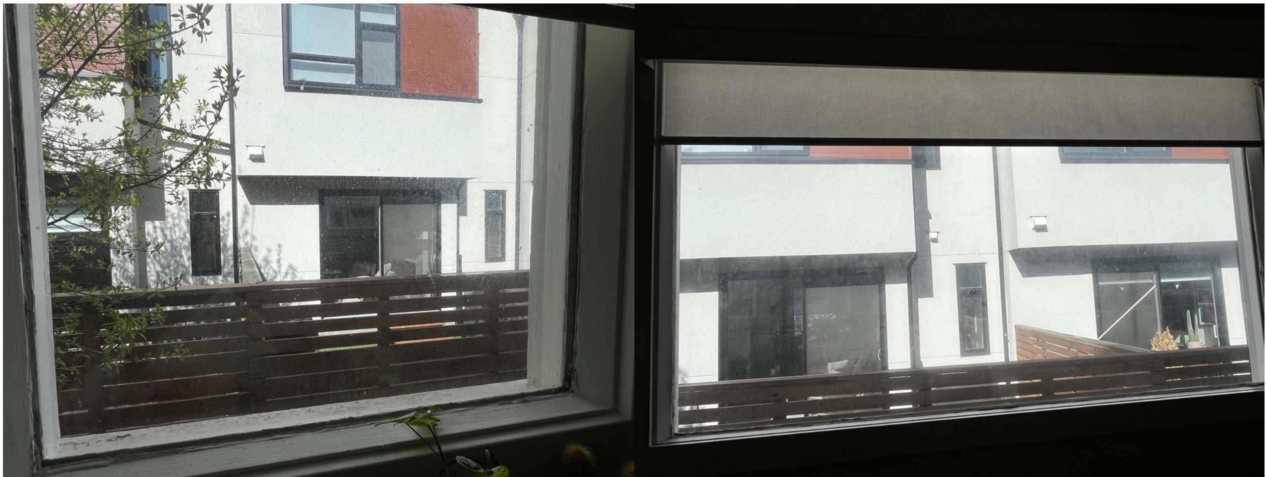
Views from my kitchen (left) and dining room (right) windows.