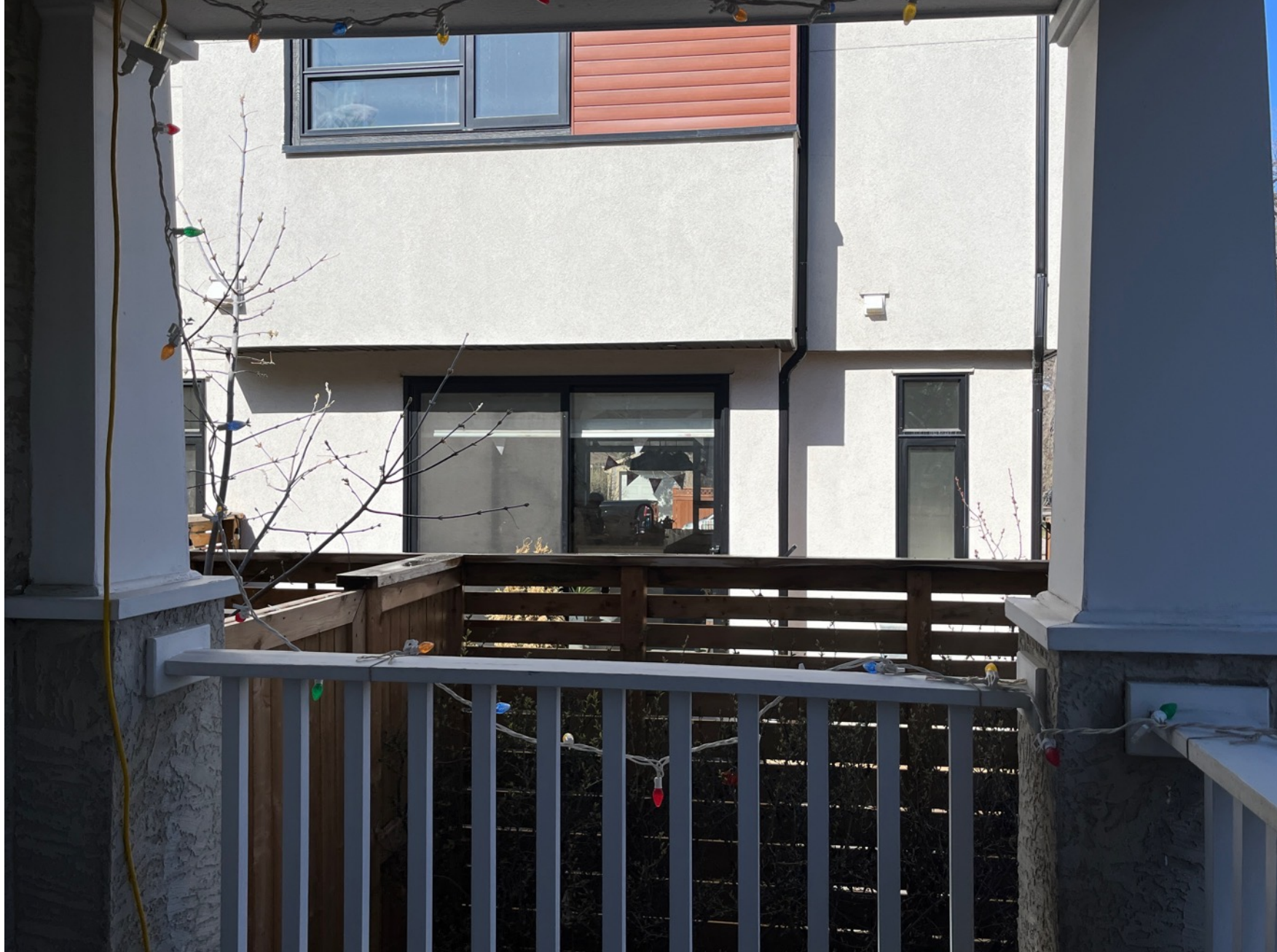
Standing on my front porch looking west.