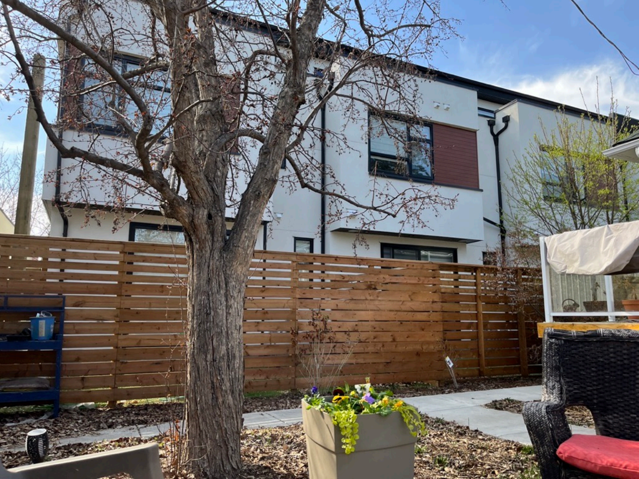
View from my backyard