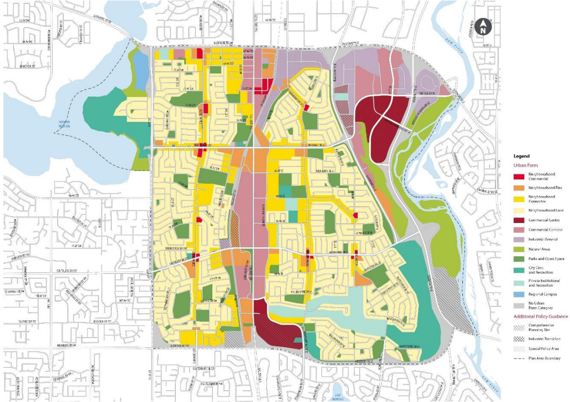
Map 3: Urban Form