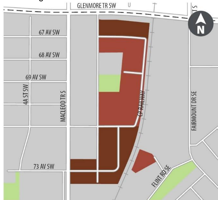
Figure 14: Midtown Building Scale with LRT Station and Affordable Housing