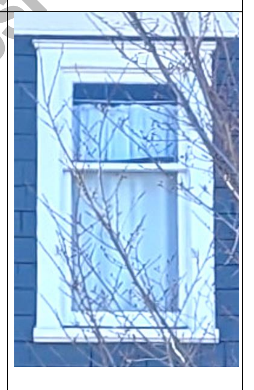
(Image 2.9: example of wooden casings with protruding drip molds and sills on upper storey)