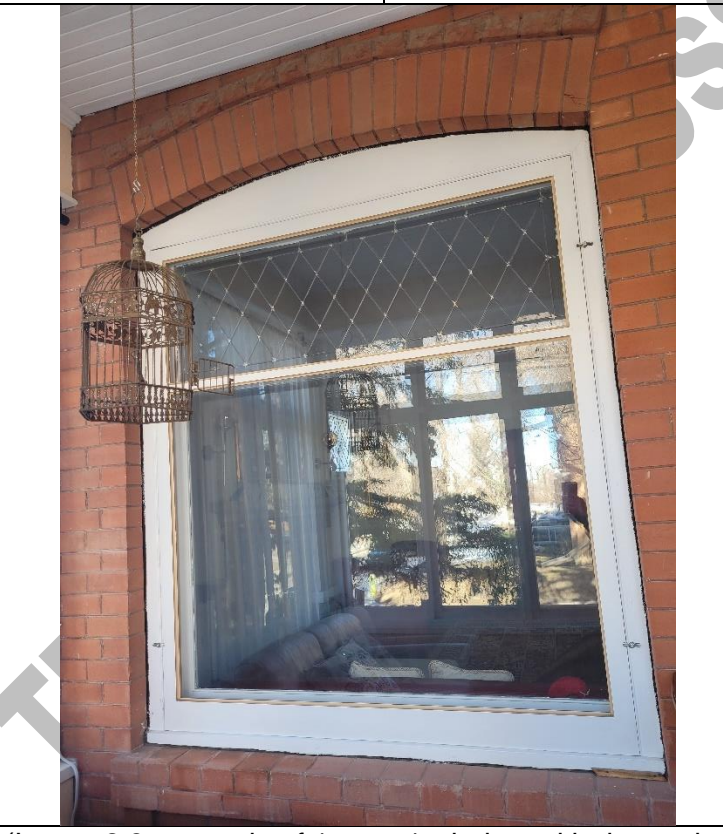
(Image 2.8: example of 1-over-1 window with decorative diamond patterned upper sash; segmental arch brick headers topped with rusticated course and protruding double course brick sills)