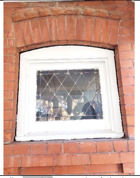
(Image 2.7: example of single sash window with decorative diamond patterned)