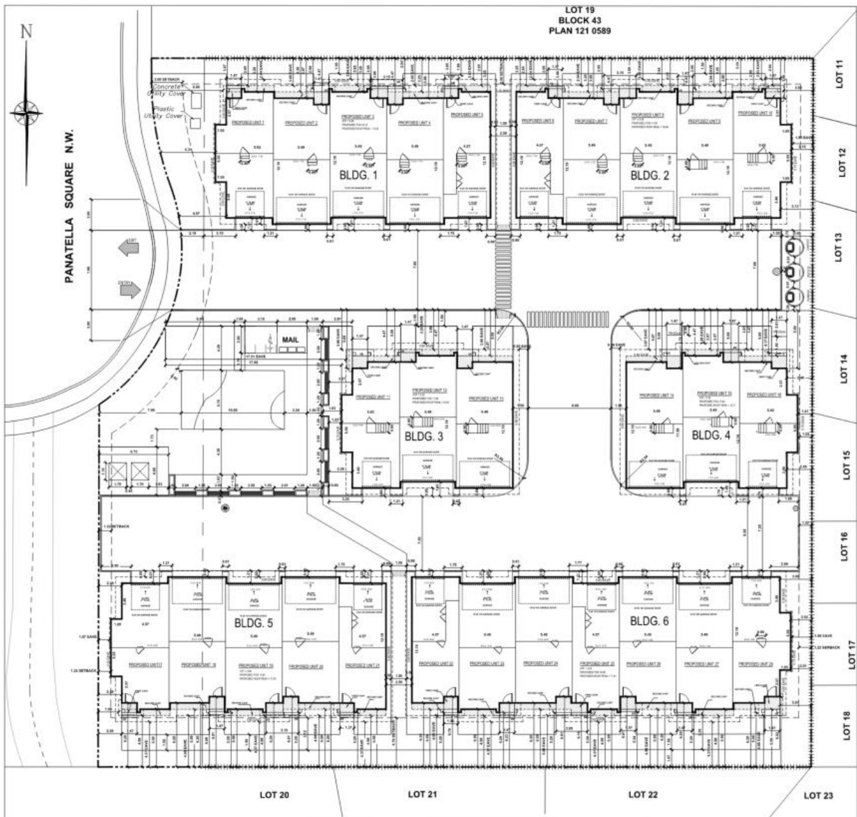
Figure 1: Site Plan

The following excerpts (Figures 1-3) from the development permit application provide an overview of the proposal and are included for information purposes only. DP2022-08512 proposes a 28-unit townhouse development incorporating the road closure area with the adjacent parcel of land. The proposed building height is 11.5 and the proposed density is 28 units (the maximum density is 39 units).