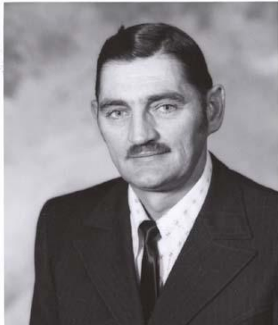
City of Calgary Archives CalA PP-01257

Alderman Hodges is a lover of parks and green spaces. Alderman Hodges also played a significant role in the establishment of the ENMAX Legacy Parks Program to ensure a consistent source of capital funding for City parks."