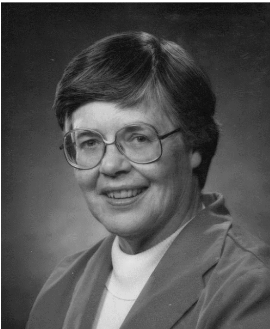
City of Calgary Archives CalA PP-03150

Further, his work on the Public Service Committee maintaining linkages with the City Planning Department proved that collaboration is possible and can save many hours of costly (time and money) appeals. Another major achievement led by Craig was the reactivation of the Audit Committee in City Hall. This process improved the efficiency of city departments and task forces and was noted that in one year it saved taxpayers $22 million. Craig believed citizen representation was strengthened by effective communication between the various orders of government. Thus, he worked hard to represent the voice of the City of Calgary at AUMA and FCM. Craig's ethic of public service and collaboration was a significant influence on City Council."