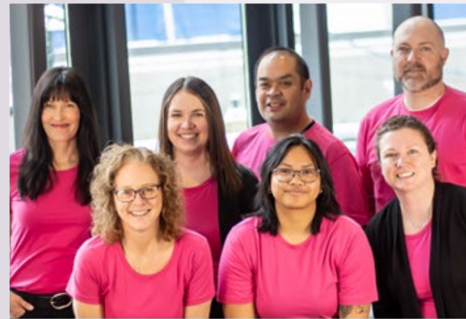
Calgary Convention Centre Authority Presentation