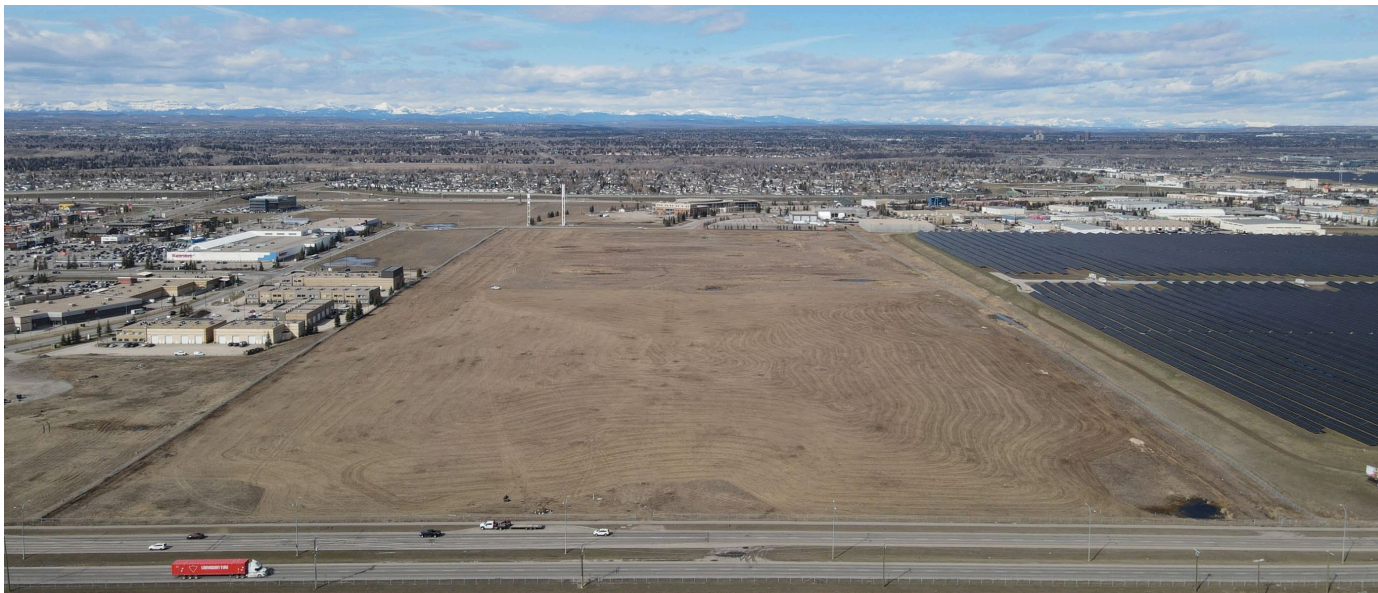
Looking west at the future MSF site.