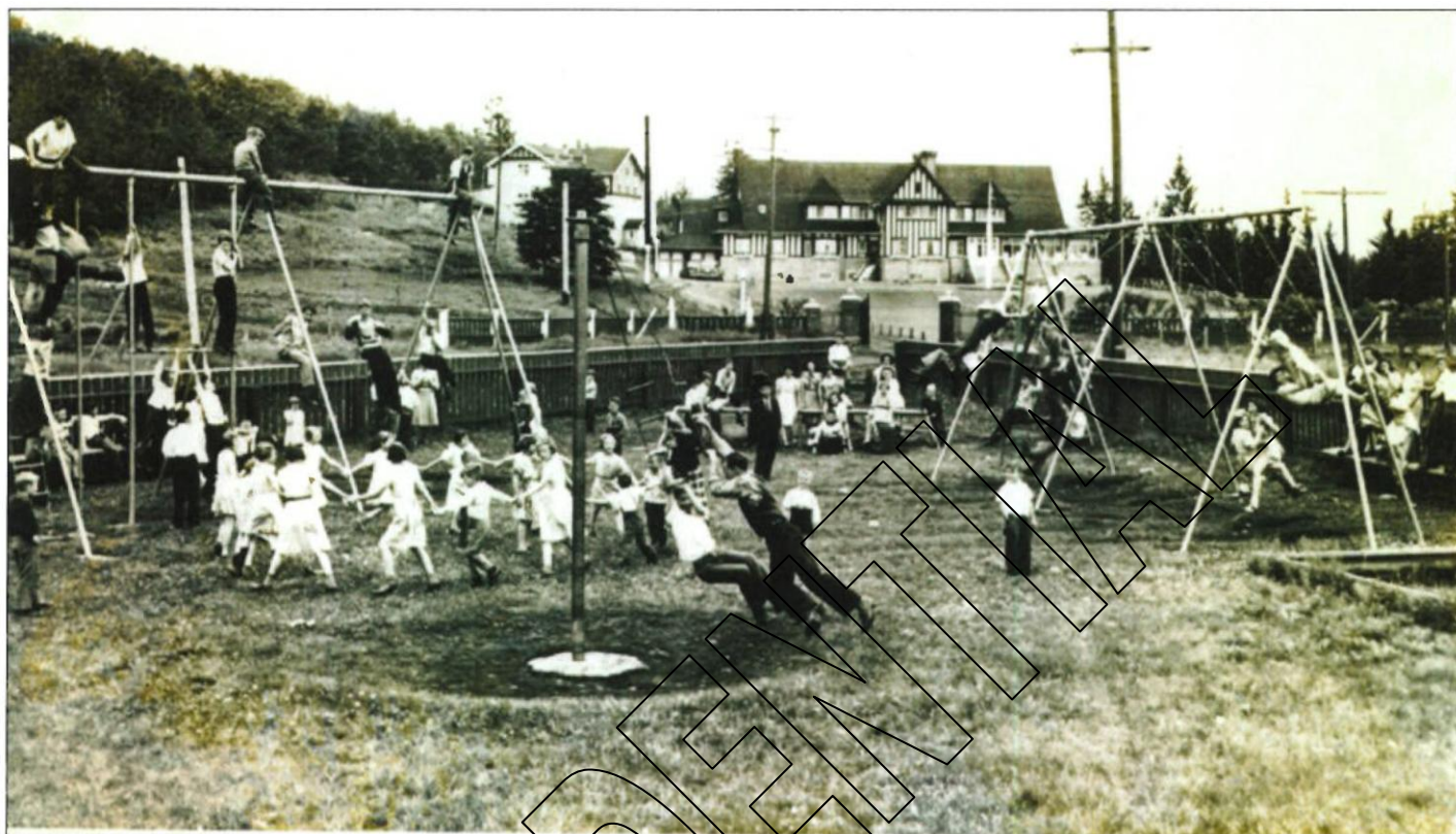
Children from Wood's Christian Home in playground in front of the Bowness Home c. 1950

(This playground is now part of a triangular-shaped park area bordered by 48th Avenue, 33rd Avenue and 89th Street NW.)