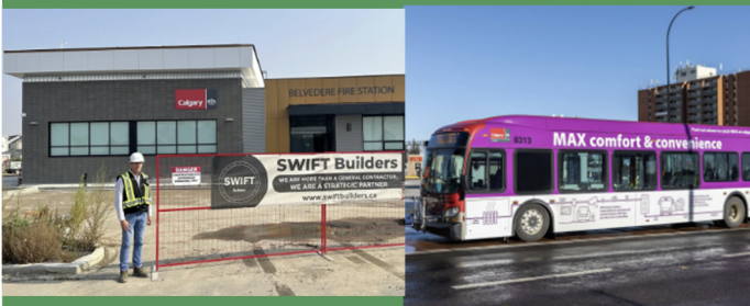
Belvedere Fire Station MAX Purple

The Liberty lands benefit from adjacency to full scale commercial amenities located in East Hills Shopping Centre including the MAX Purple Station and the recently completed Belvedere Fire Station.