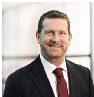
PRESIDENT AND CEO