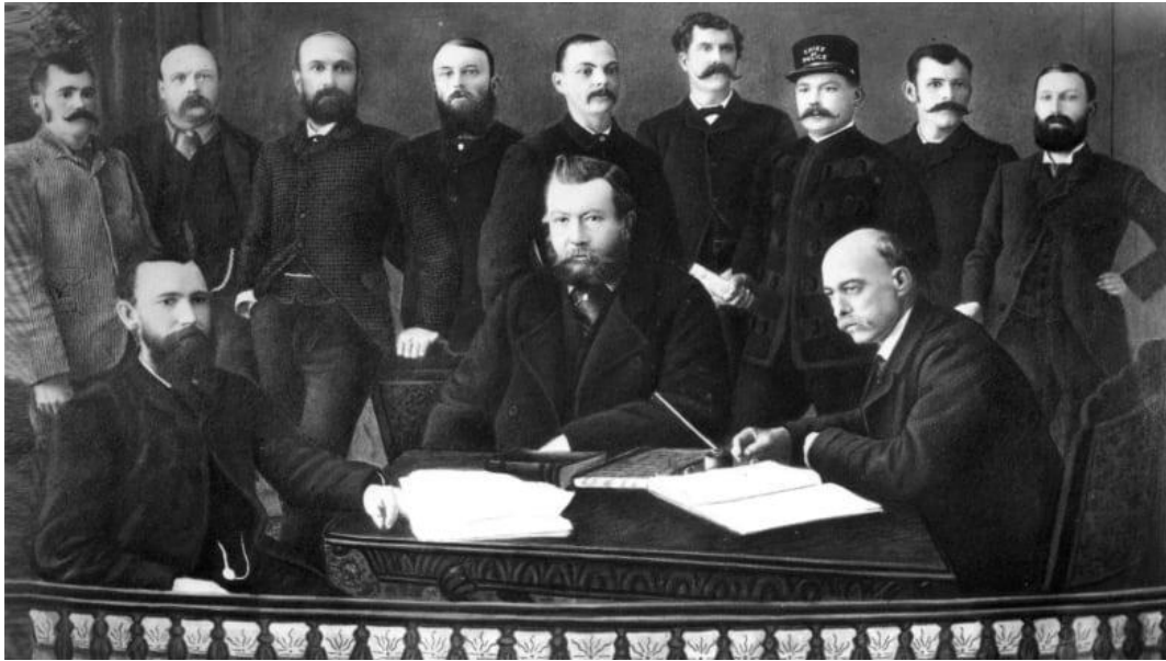
Glenbow Archives NA-644-30