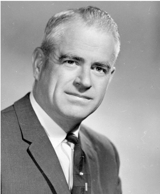
City of Calgary Archives CalA PP-01205

Named Asset Location: Shepard Wetland Legacy Park SE Naming Authority: Council, 2007 May 28 Council Motion Naming Approval Date: 2007 May 28 Excerpt from Approval Documents: Information not available