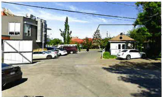
2 ST Subject Site