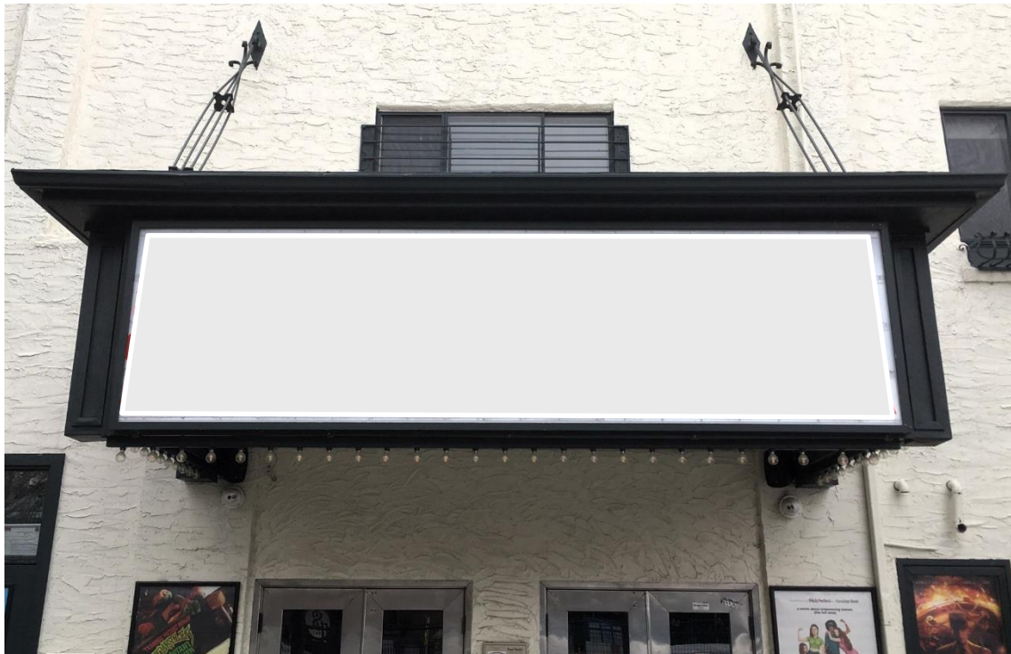
(Image 3.3: Detailed front image of suspended marquee over central doorways)