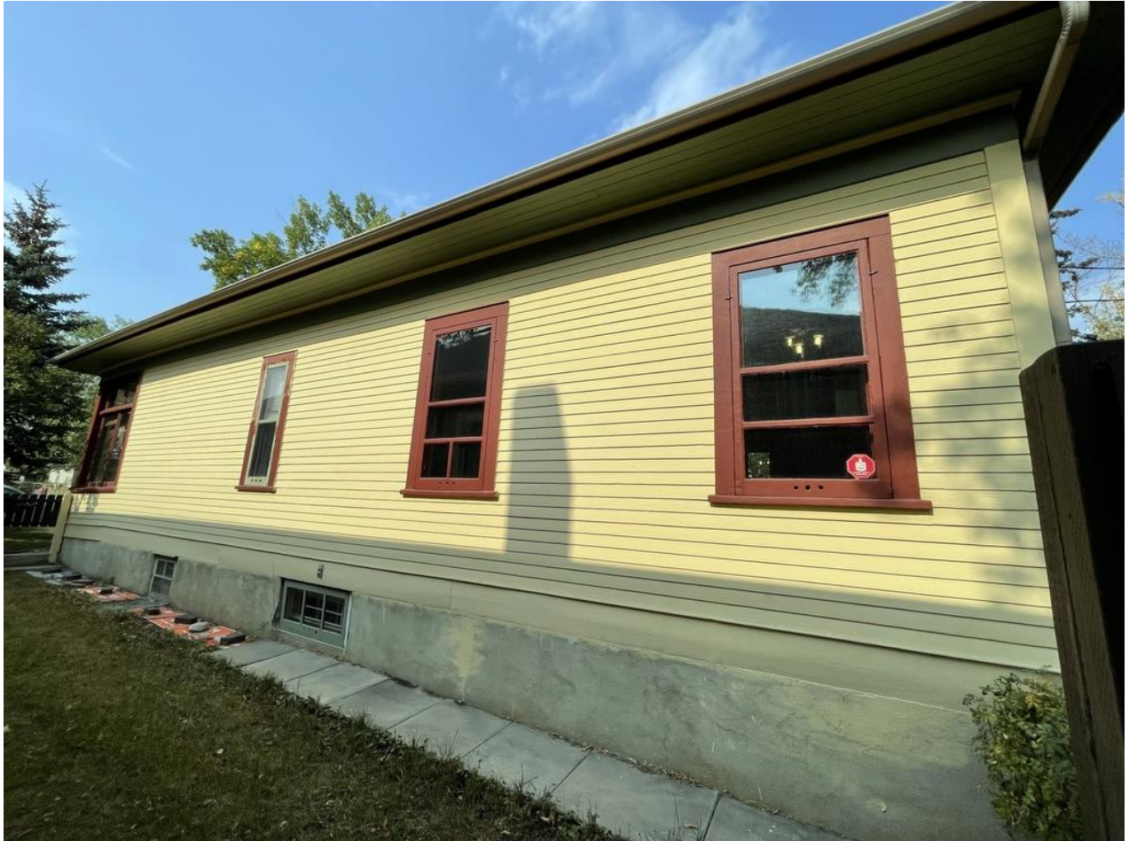
(Image 1.6: South façade showing single assembly 1-over-1 wooden window sash including 2, 3 and 4-light wood storm window sashes, wooden mullions, heads, and sill; beveled-wood siding. Note: storm windows are not regulated)