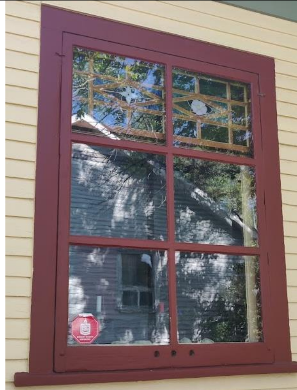
(Image 1.8: Example of typical 1-over-1 wooden window sash. Note: storm window is not regulated)