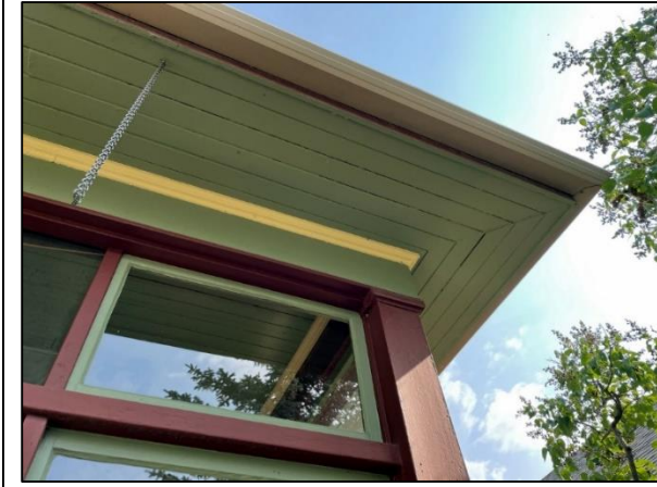
(Image 1.3: Overhanging eaves, wooden tongue-and-groove soffits, moulded wooden frieze, plain wooden fascia)