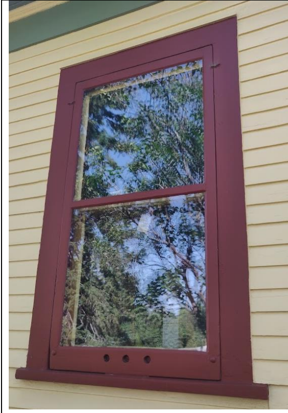
(Image 1.7: Example of typical 1-over-1 wooden window sash. Note: storm window is not regulated)