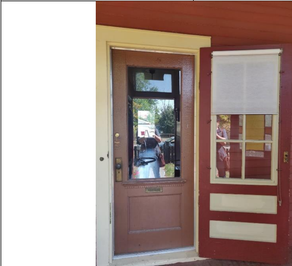
(Image 1.5: central front entry door opening and wooden casing – verandah interior)