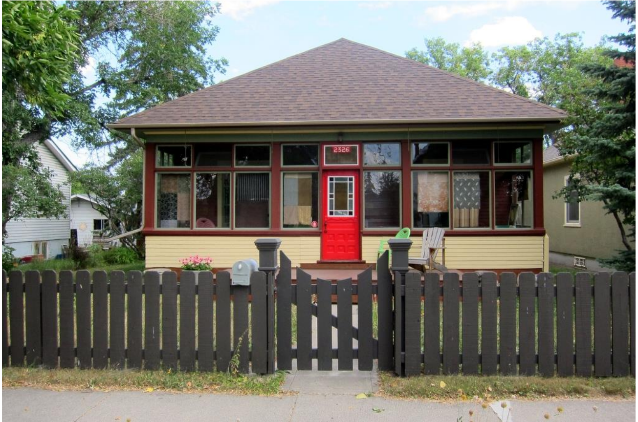
(Image 1.1: West façade with full-width enclosed verandah; single-assembly and triple-assembly wooden window and transom sashes evenly segmented by wooden mullions, posts, heads and sills, central entry door; steeply-pitched hipped roof)