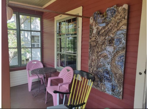
(Image 1.4: Interior of enclosed verandah showing exterior north-facing six-light double-assembly windows: wooden tongue-and-groove ceiling, beveled wood siding on interior walls, crown moulding, wooden plank flooring; 1-over-1 wooden hung-sash windows including 6-light wood storm window sashes, wooden mullions, heads, and sills)