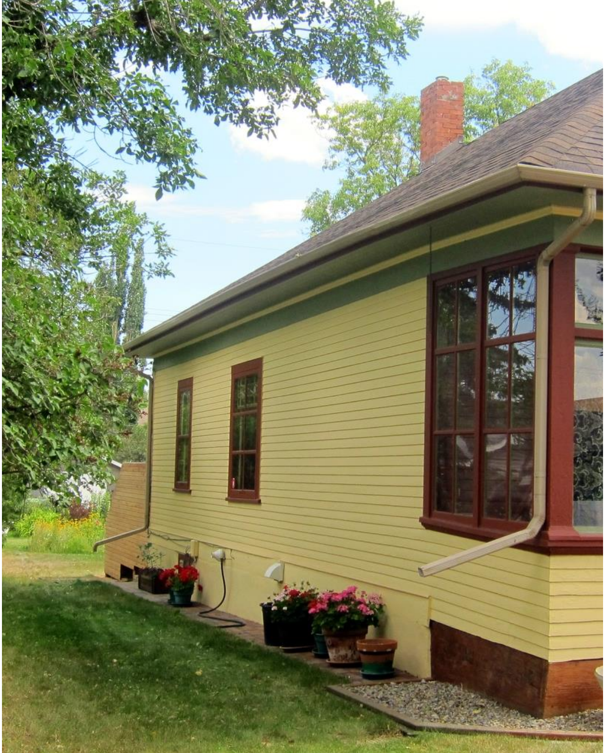
(Image 1.2: North façade showing six-light double-assembly wooden window sashes evenly segmented by wooden mullions, posts, heads and sills (enclosed verandah); 1-over-1 wooden window sash, wooden mullions, heads and sills; beveled-wood siding; moulded frieze, plain wooden fascia, overhanging eaves. Note: storm windows are not regulated)