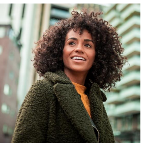
Page 6 of 15