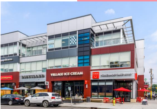
Construction impacts on businesses