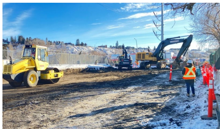
Feedermain removals on 6 Street S.E.

Utility relocations in Beltline and Downtown continued in January, with multiple third-party utility projects on downtown avenues, and ENMAX transmission work advancing in Beltline East. ENMAX construction also started work on 3 Street S.E. between 10 and 12 Avenue.