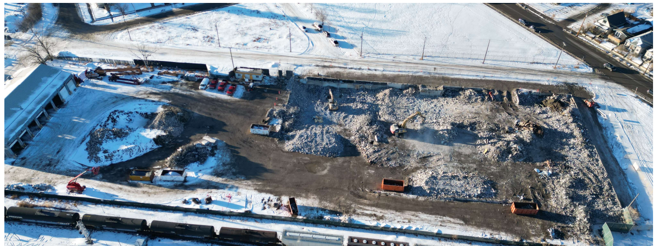
Lilydale demolition site