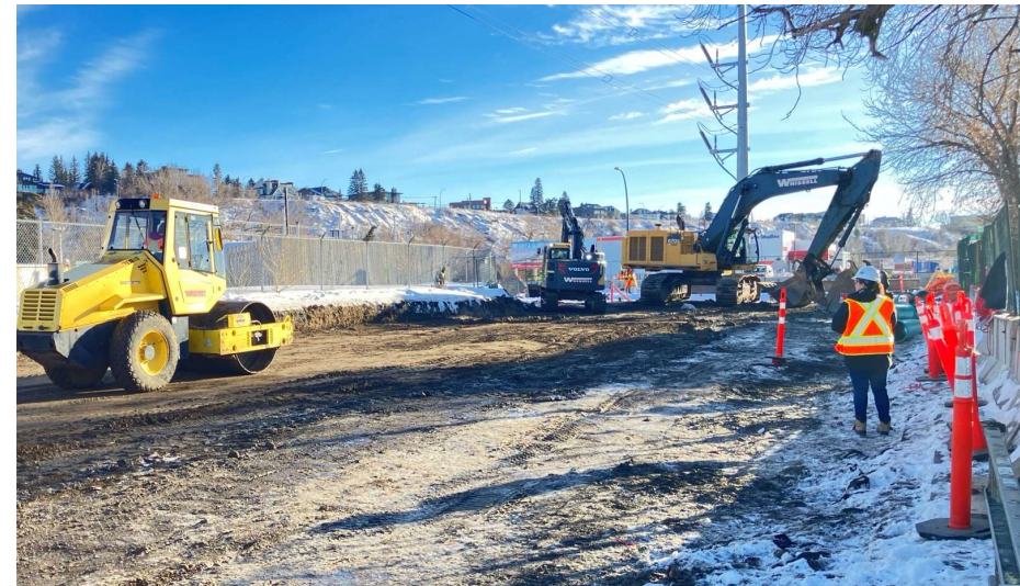
Feedermain removals on 6 Street S.E.