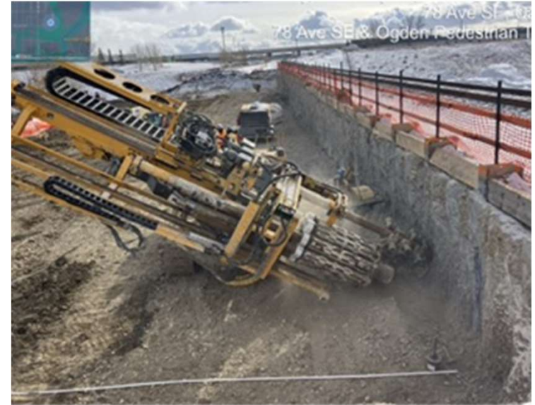
Looking north at the tie back installation work at 78 Avenue Project.