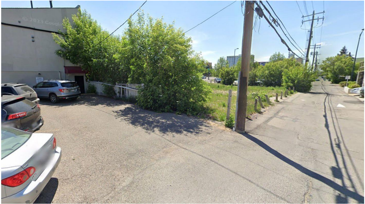
View Southwest from the lane towards the site