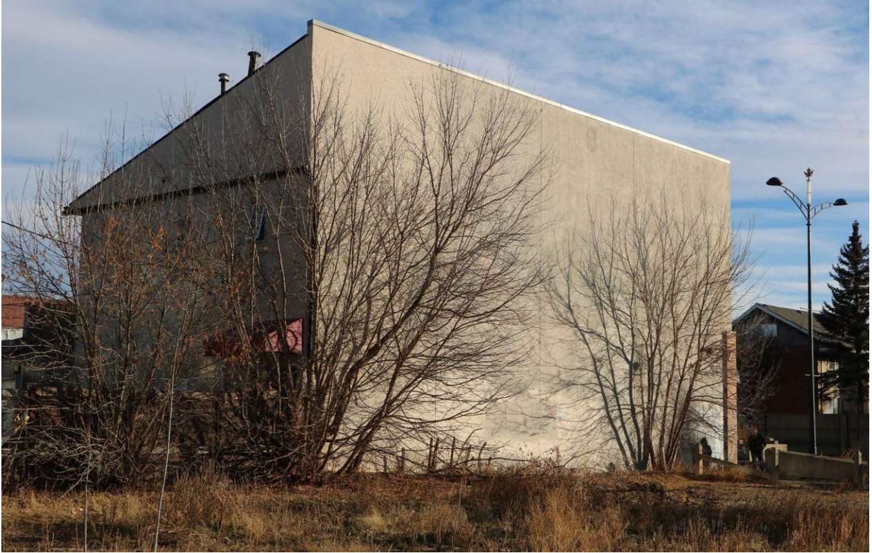
Aquila Books Building west facade