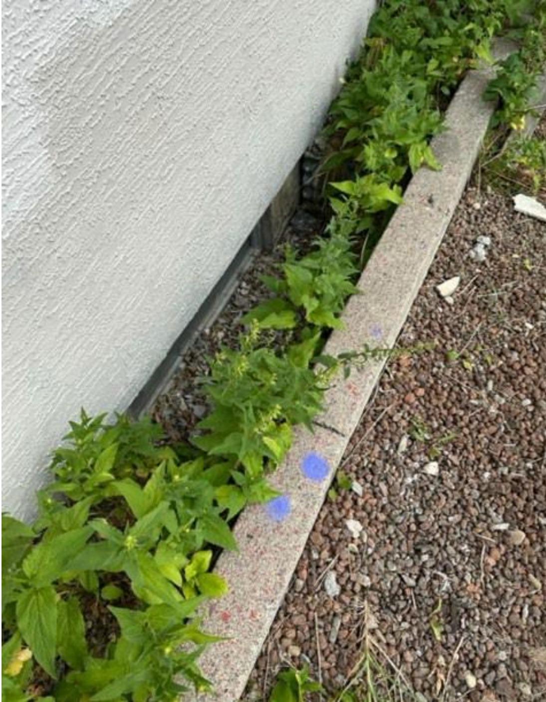
Building's west facade is almost at the west property line