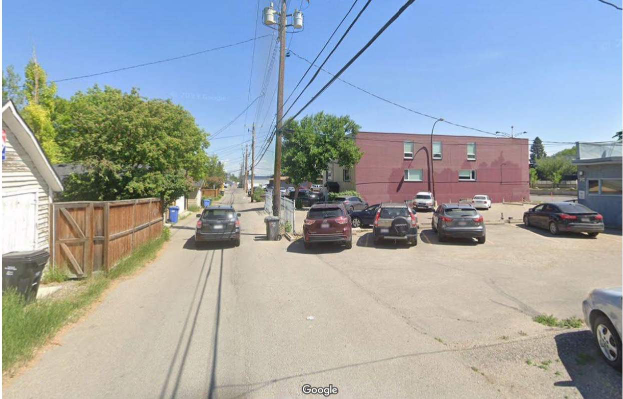
View East at the lane