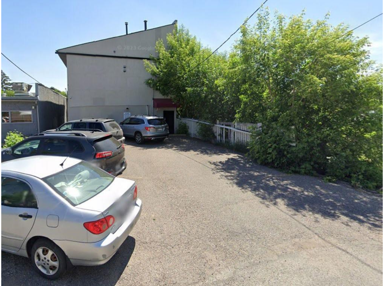
Parking stalls at the rear – Aquila Books