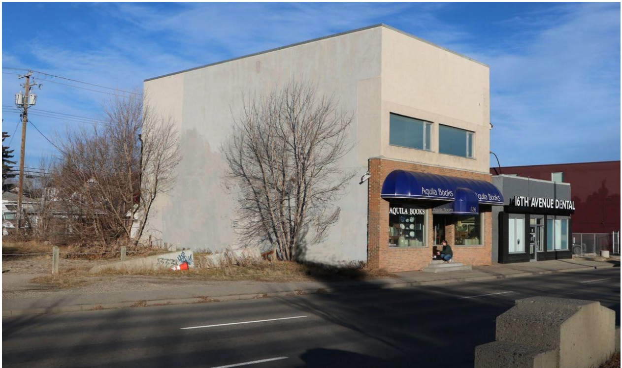
Aquila Books - 826 16 th Avenue SW