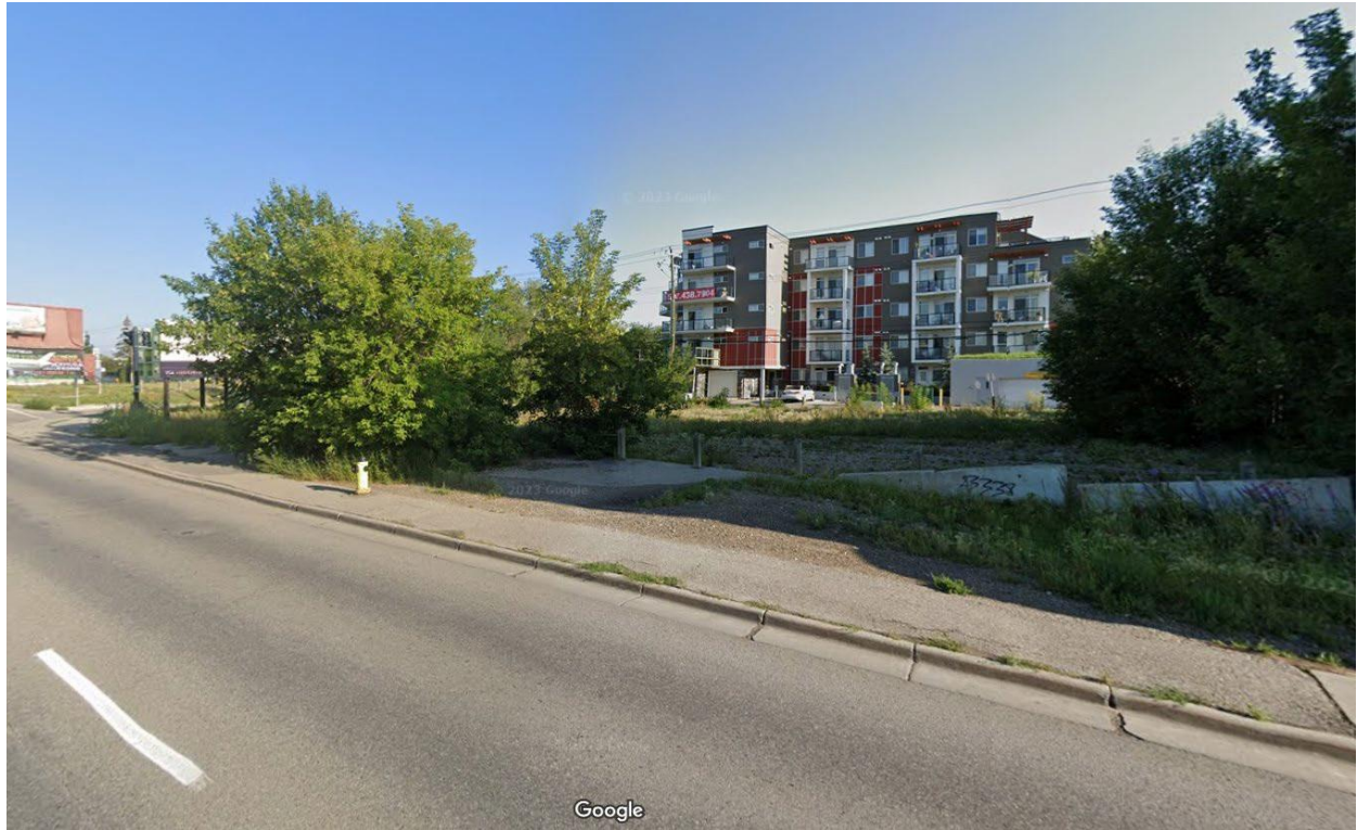
View Northwest from 16 th Avenue