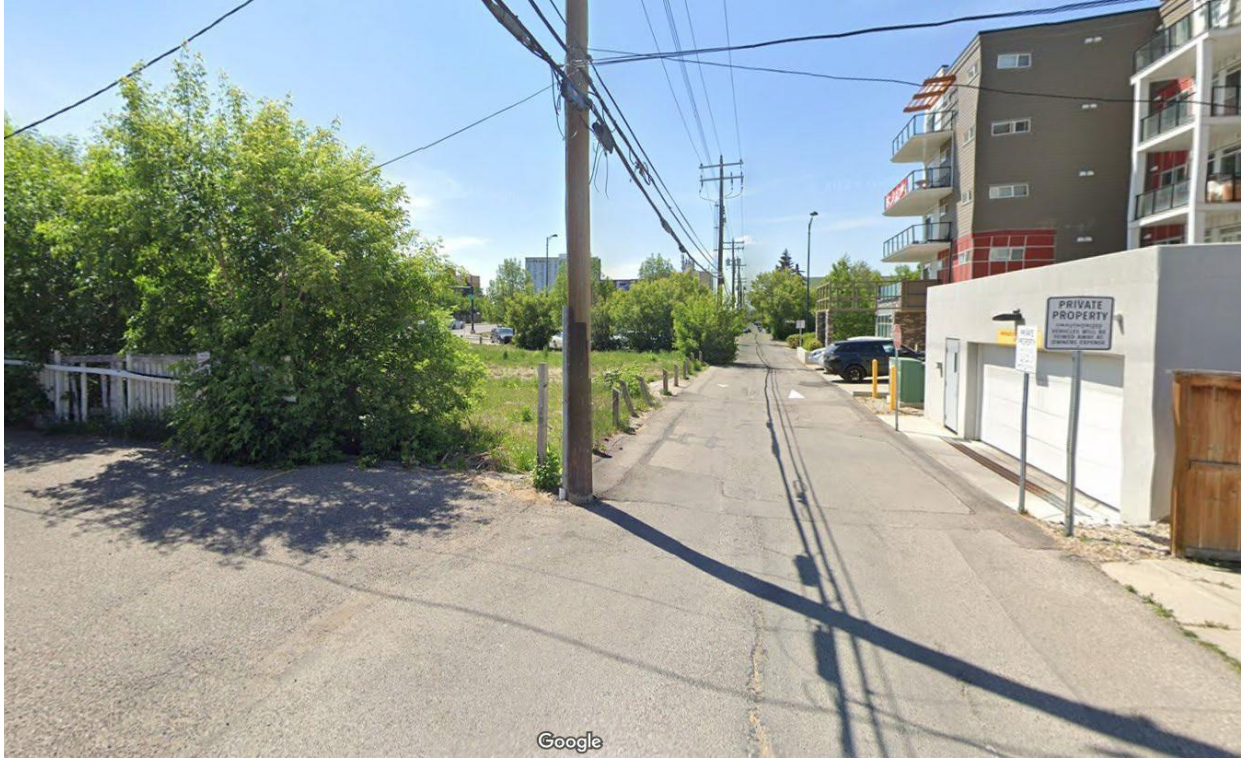
View West at the lane