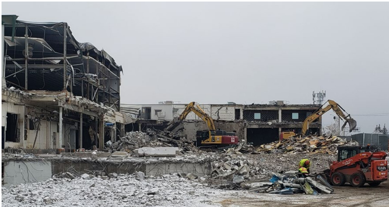
Demolition of the former Lilydale Poultry plant is well underway.