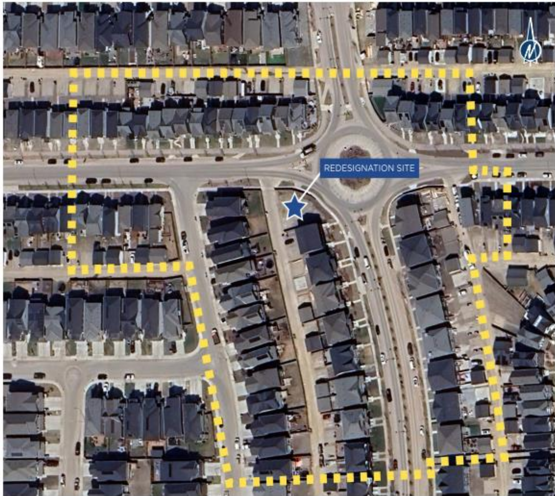
Figure 1. Community Door Knocking