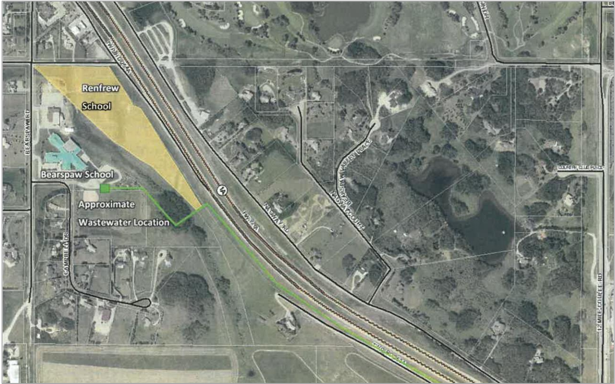
Figure 1: Map of projected servicing area (Wastewater Servicing Request, Rocky View County, 7 June 2023).