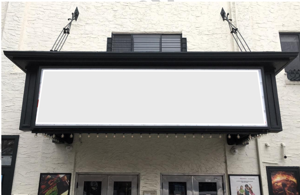
(Image 3.3: Detailed front image of suspended marquee over central doorways)