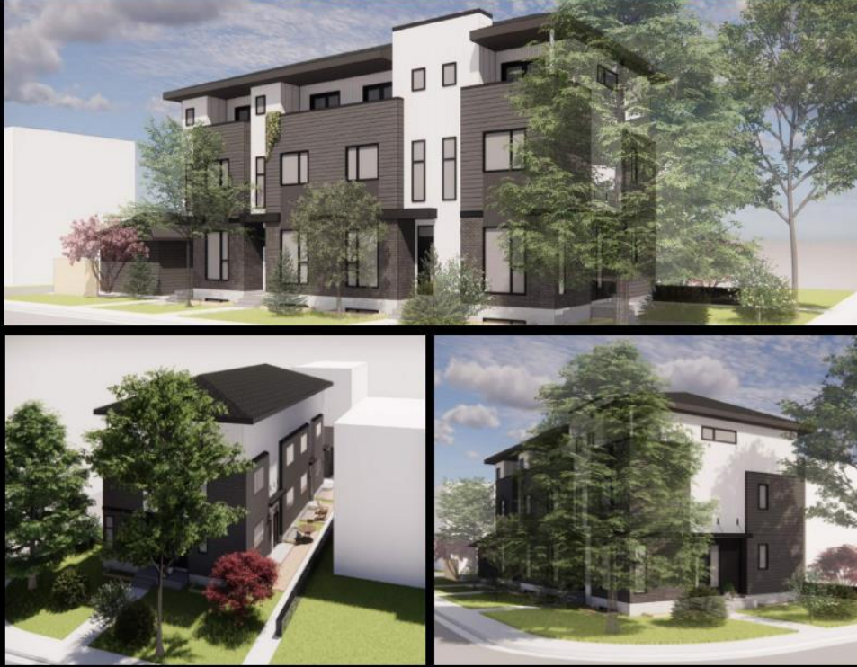
Proposed Design Illustrations