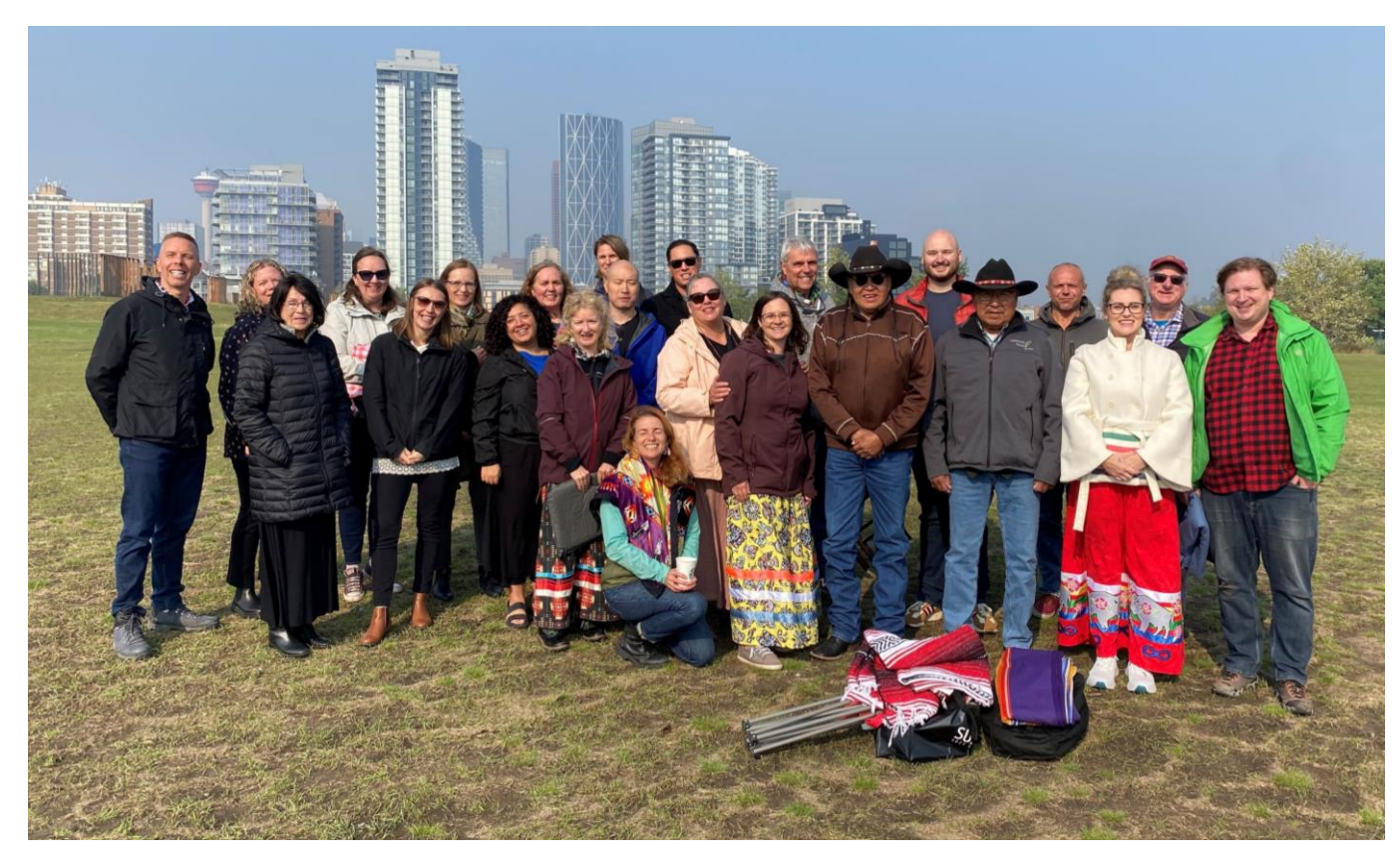
Ceremony, September 5, 2023 Members of the Indigenous Gathering Place Society, Fort Calgary, Contractor and City project team.