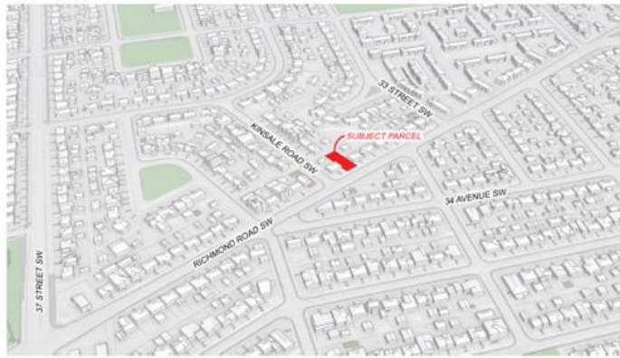
1 3D KEY PLAN A1