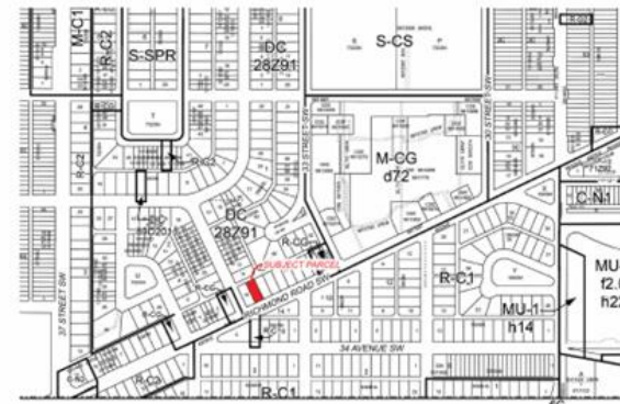
5 LAND-USE ZONING KEY PLAN A1