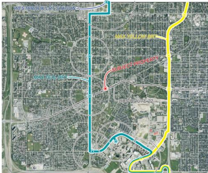
2 TRANSIT KEY PLAN A1