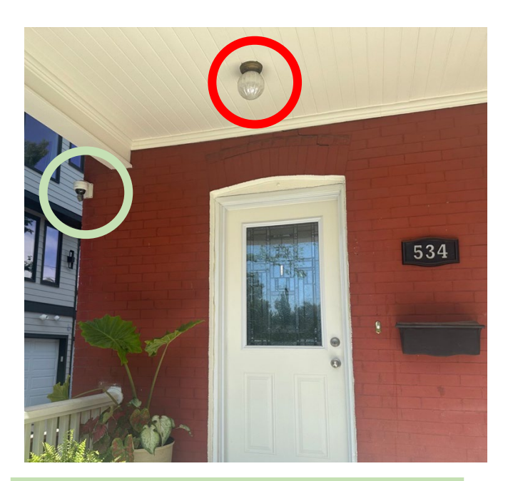
Surveillance camera and motion-detection light