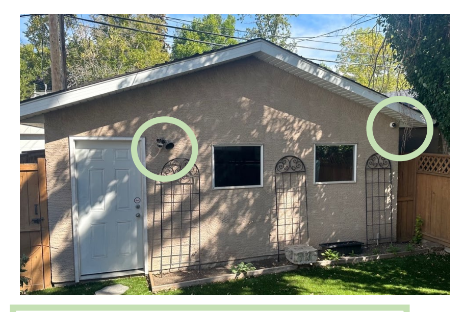
EXHIBIT 3: Unattached garage as seen from back door entrance