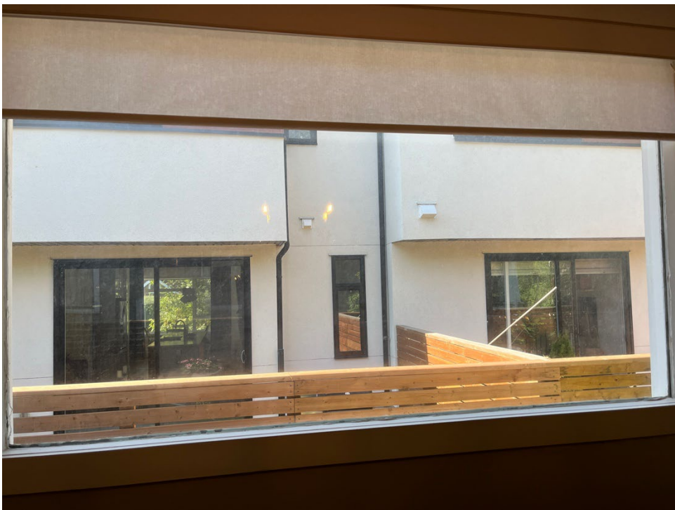
View from my dining room window.