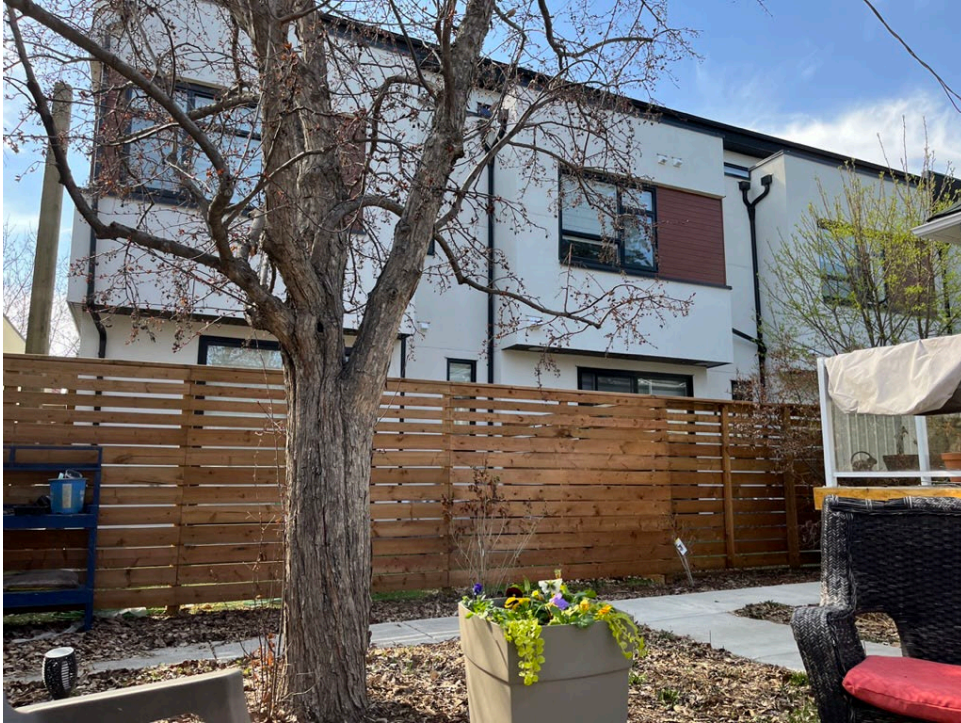
View from my backyard.