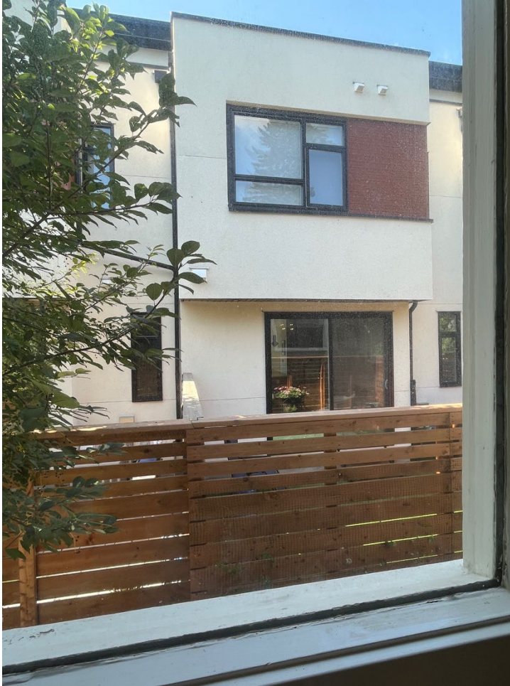
View from my kitchen window.