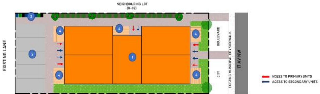
PROPOSED SITE CONCEPT