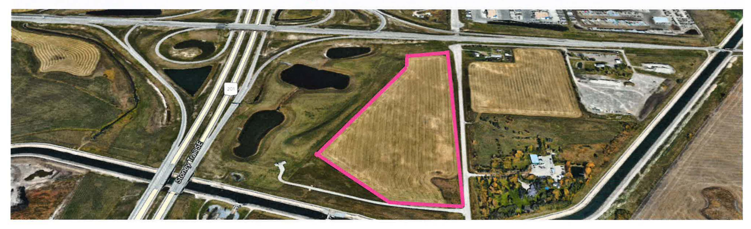
Agenda Item: 7.2.32