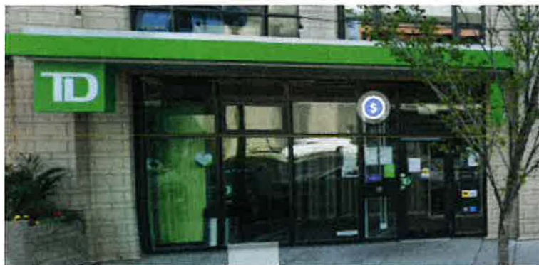
Image 2: TD Bank on 17 th AVE SW