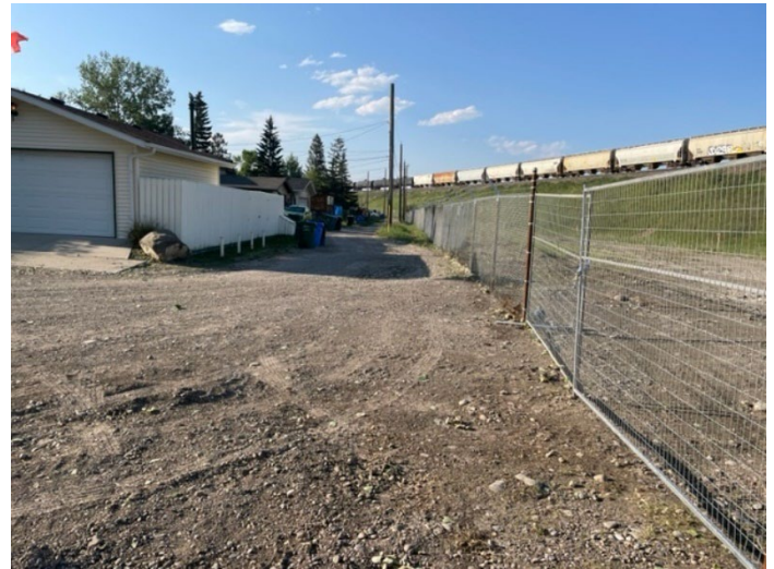
Looking north towards the safety fence installed between the work zone and residences.