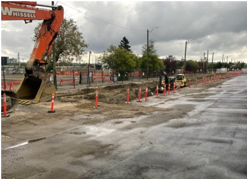
Looking east at deep utility relocation work along 12 Avenue S.E., east of 5 Street S.E.