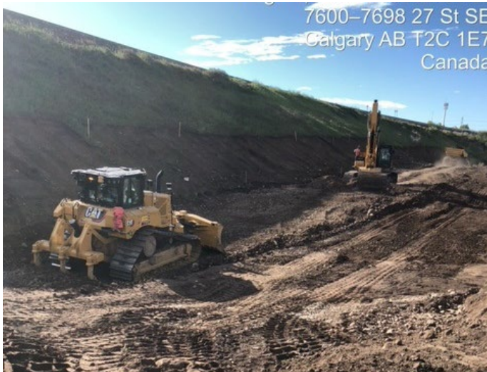
Looking East at the preparatory work to construct the 78 Avenue diversion embankment.

Construction began on July 26, 2023 with stripping and cleaning of a culvert prior to starting the critical construction of embankments for temporary diversion of freight tracks.