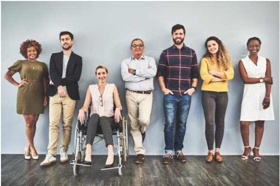
Housing for equity-deserving