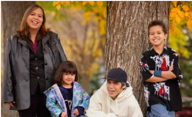
Housing for Indigenous people