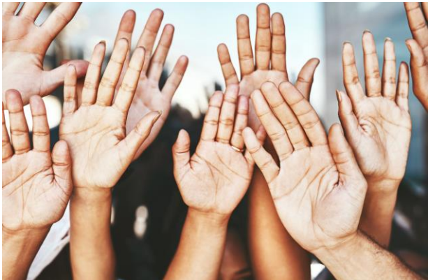
Resilient housing sector