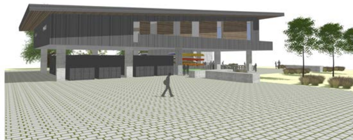
Harvie Passage Whitewater Centre