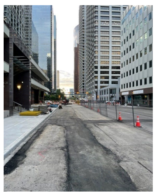
Looking east at Enmax duct bank work along 5 Avenue S.W., west of 2 Street S.W.

The following tables summarize utility relocation works that continued throughout the month of July with a look ahead at planned construction activities for the month of August: