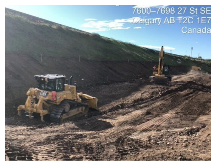
Looking East at the preparatory work to construct the 78 Avenue diversion embankment.

Construction began on July 26, 2023 with stripping and cleaning of a culvert prior to starting the critical construction of embankments for temporary diversion of freight tracks.