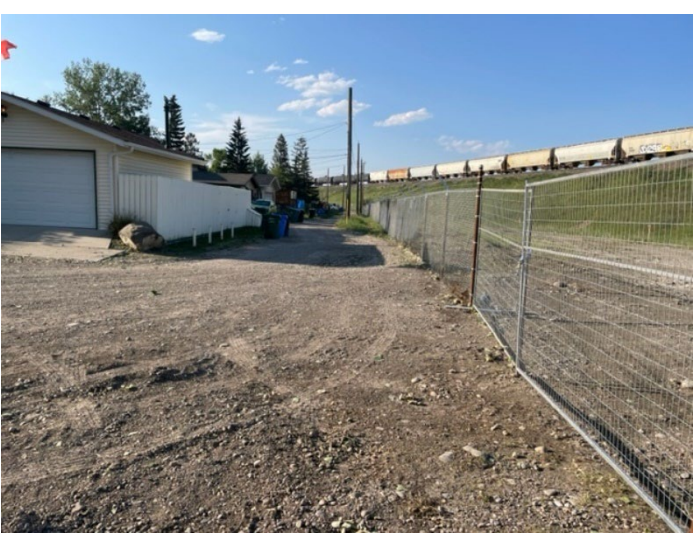
Looking north towards the safety fence installed between the work zone and residences.