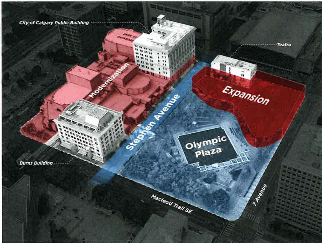
Figure 1: Areas shaded in blue indicate additional geographic area to included in the updated Arts Commons Transformation tri-party Development Management Agreement.