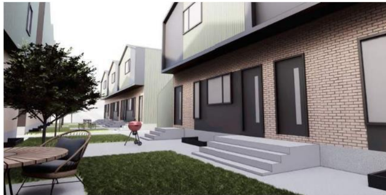
Courtyard visualization: subject to change via municipal review of future Development Permit Application.