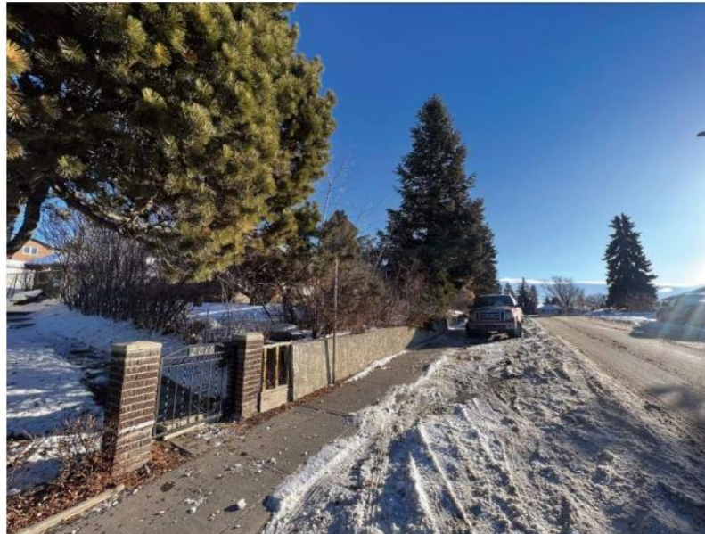
Site Photo, March 2023 (Looking east on 11 AV SE in morning; 2816 11 AV SE on left)