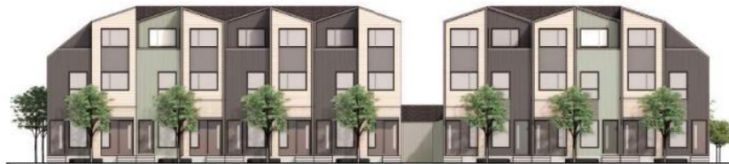
Front yard elevation: subject to change via municipal review of future Development Permit Application.

CivicWorks and 13 Capital are committed to being good neighbours and working with citizens and community groups throughout this application for land use redesignation at 2822-2828 11 AV SE (project name AP2822). As part of our process, we contacted surrounding area residents, the local Ward 9 Councillor's Office, and Albert Park / Radisson Heights Community Association (APRHCA) at the outset of the application (May 2023) to encourage them to share questions or concerns.