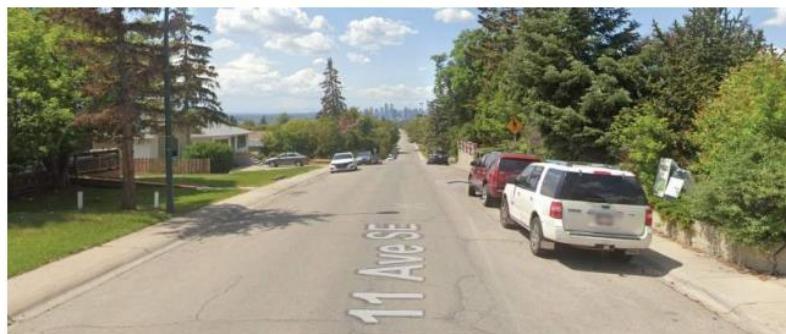
Google, June 2023 (Looking west down 11 AV SE in afternoon: AP2822 site signage on right)

Regarding on street parking availability, a Google street view search (imagery from June 2023) and site photos (March 2023) confirm that there is ample on-street parking available at different times of the day within the City-owned right of way near the subject site.