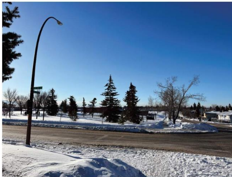
Site Photo, March 2023 (Intersection of 12 AV SE/28 ST SE in morning; note 28 ST SE has bike lane/school parking restrictions)