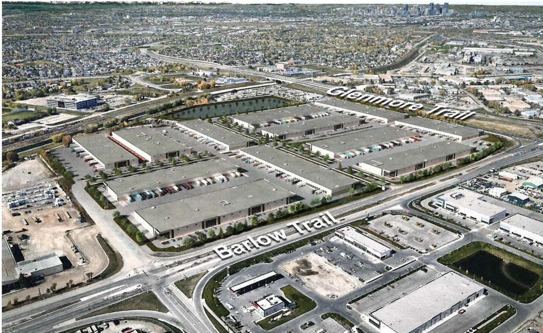
Looking NW across the Site towards Downtown