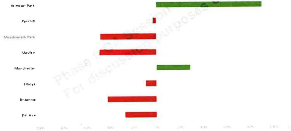
Community Population Change 1968-2019