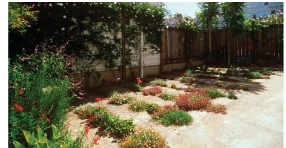
Credit: Crack Garden by CMG Landscape Architecture