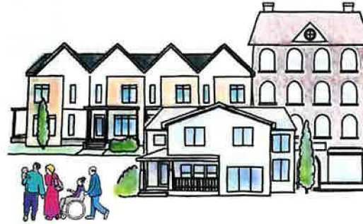
Inclusive and Diverse Housing Choices

Direction to inform decisions about future development and investment over the next 30 years.