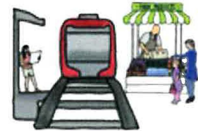
Foster Vibrant Transit Station Areas