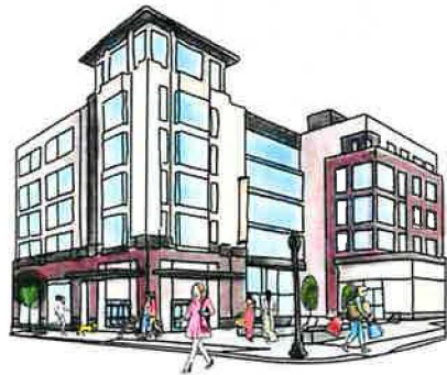
Enhance the Macleod Trail S Urban Main Street Area