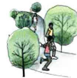
Enhance Civic Facilities, Parks & Open Spaces, and Natural Areas