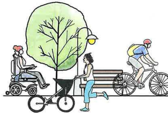
Improve Connectivity between Communities