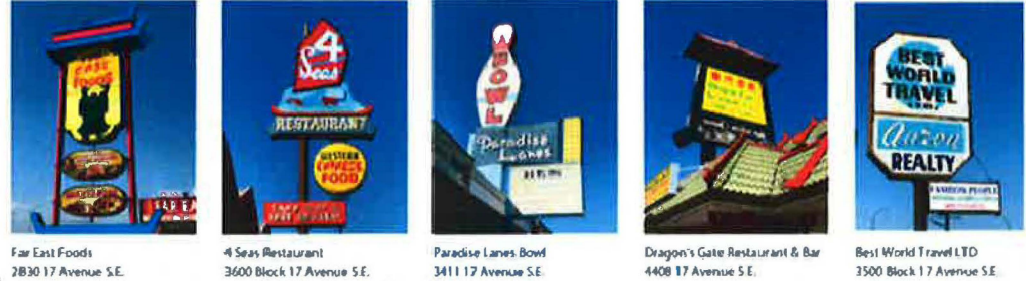
Figure 1 | Character signage