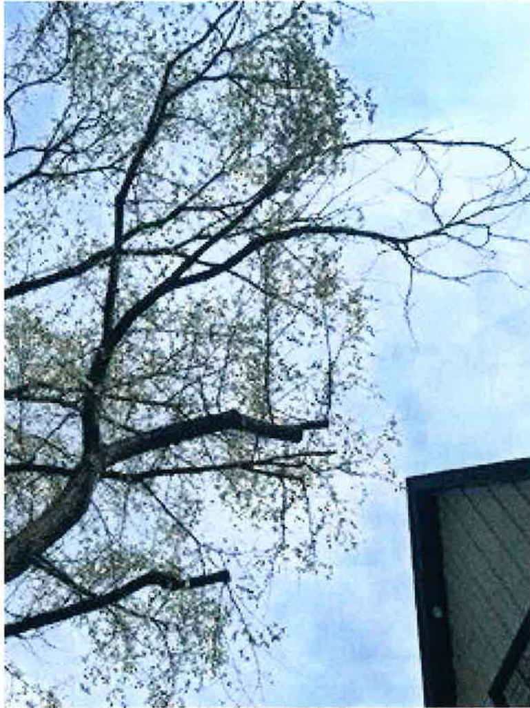
Death by a thousand cuts