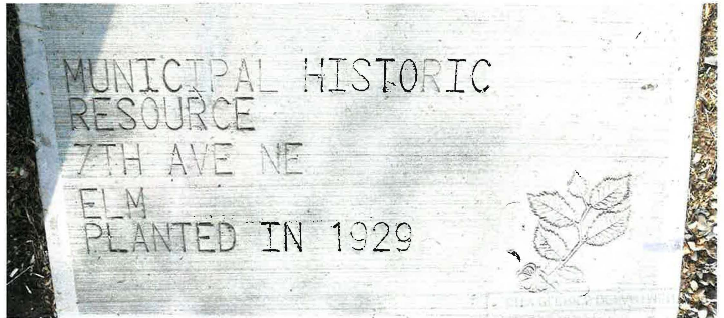
Municipal Historic Resource, planted in 1929