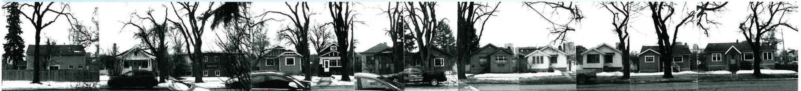
200 Block of 7 Ave NE in March 2020

Calgary's Climate Change Webinar, April 26, 2023