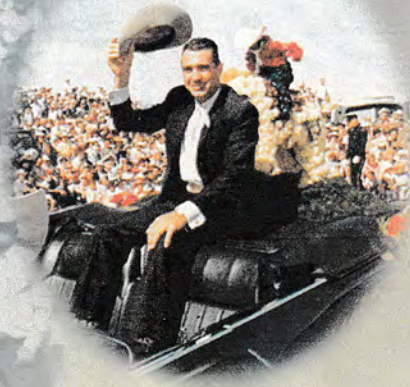
1965 Stampede Parade Marshall