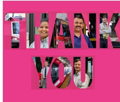
Thank your driver