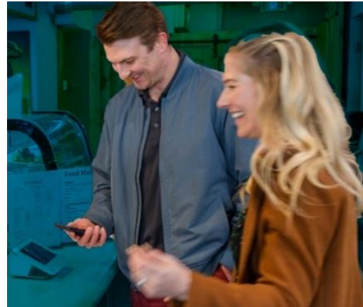
Live, work, play, stay: Creating connections in Montgomery