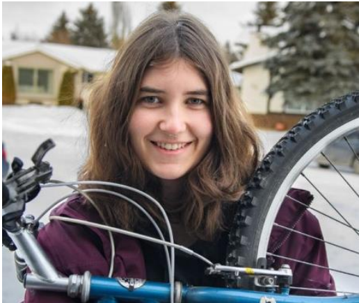
Two Wheel View helps youth pedal to their potential