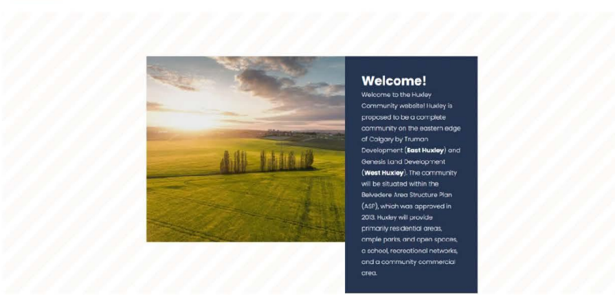
Figure 1: Image of the huxleycommunity.ca homepage