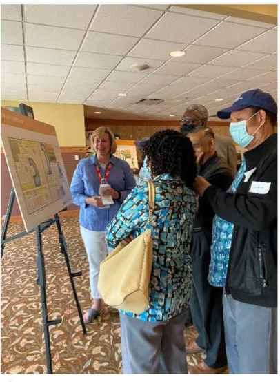
Figure 5: Urban Systems employee discussing development concept with open house participants