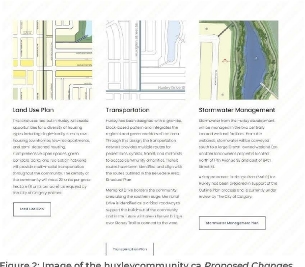
Figure 2: Image of the huxleycommunity.ca Proposed Changes webpage content