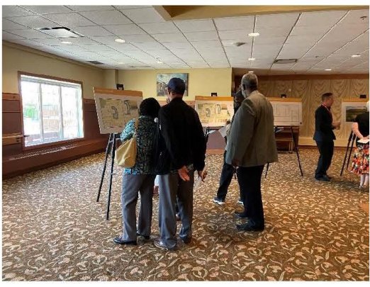
Figure 3: Participants reviewing the Huxley community development concept