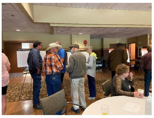
Figure 4: Participants in a group discussing the Huxley servicing information