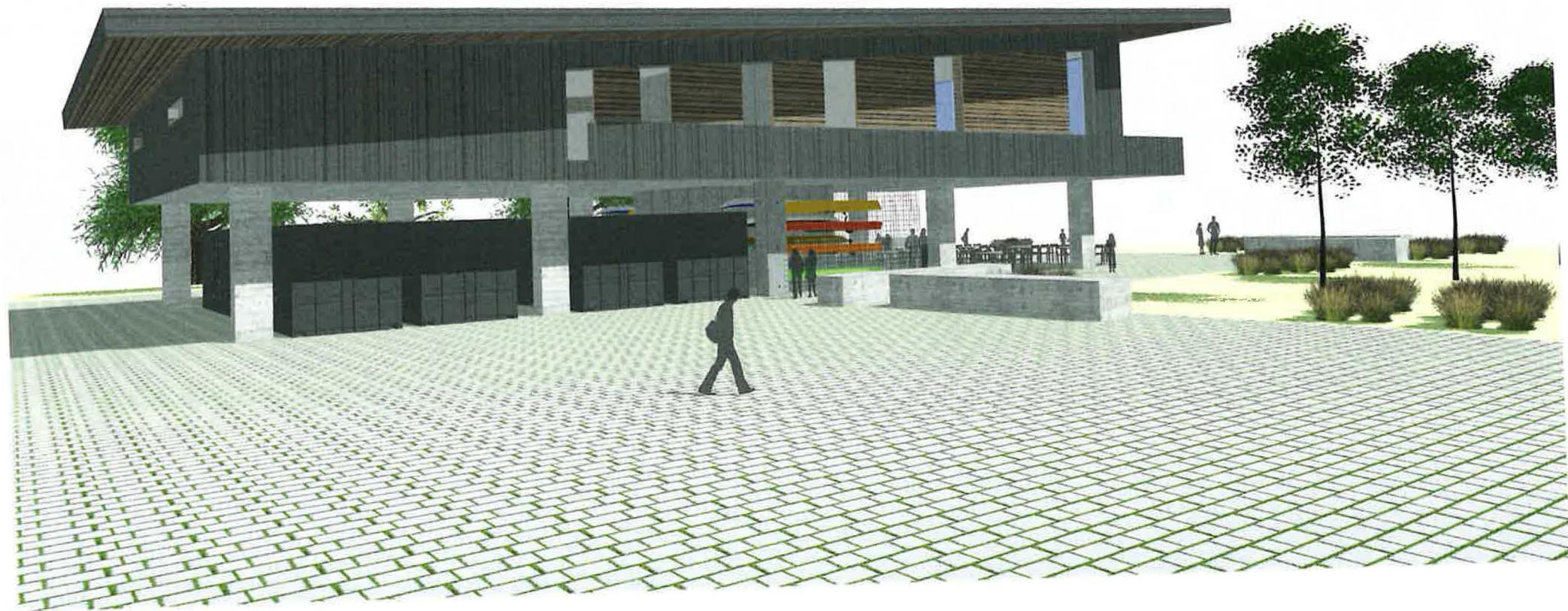
Harvie Passage Whitewater Centre