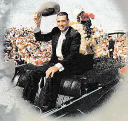
1965 Stampede Parade Marshall