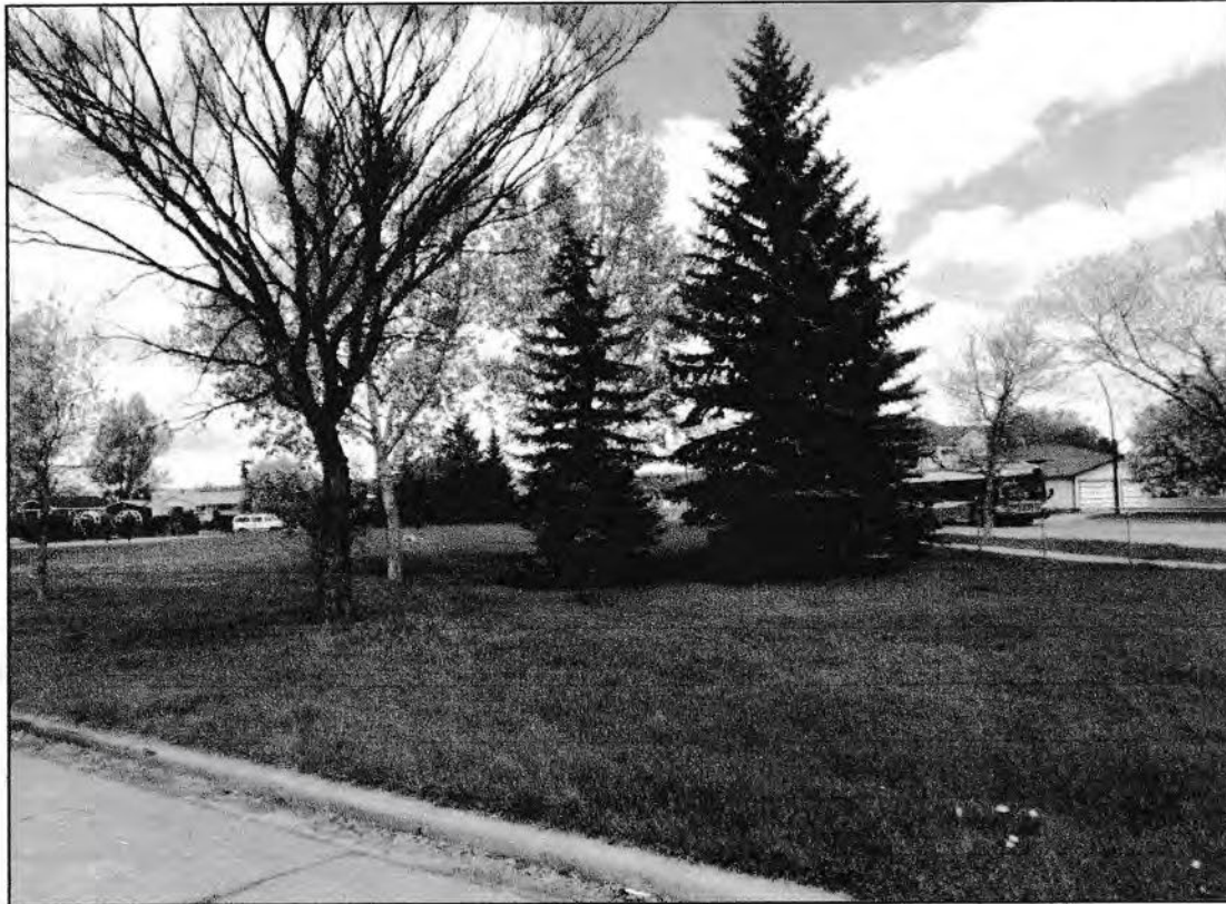
BONNIE LAING PARK

Location: Beaupre Crescent and 77th Street N.W.