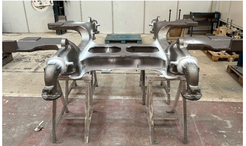
Bogie frame fabrication and welding inspections underway, the bogie will form part of the larger wheel set for the new trains (where motors, wheels, brakes, and suspension are attached).

Construction activities in Beltline and Downtown continued during the month of March. Green Line continues to work to minimize construction impacts to the travelling public and coordinate construction activities among third-party utilities, PCL who is managing BDURP construction activities on behalf of Green Line, and The City's Mobility business unit.